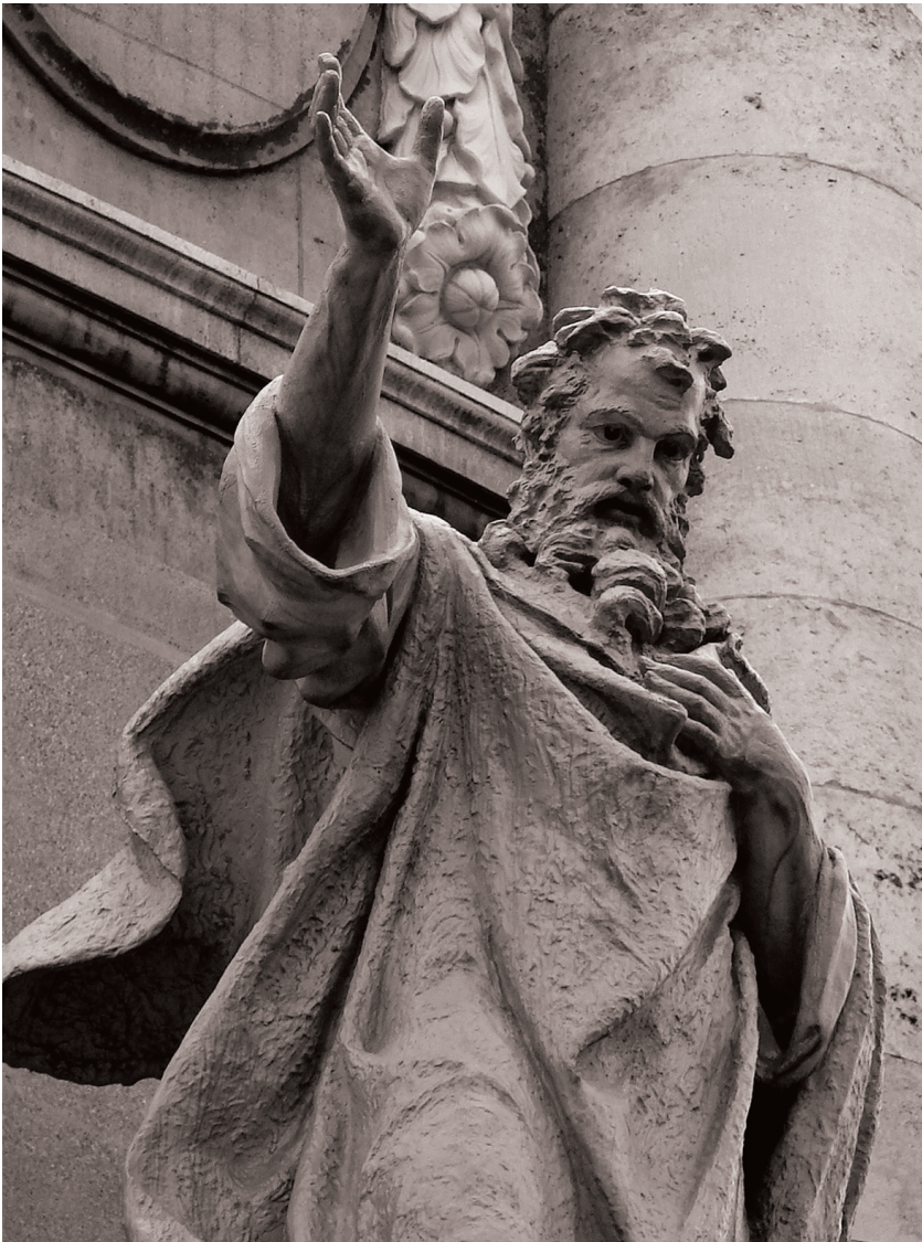
Figure 1. Irenaeus of Lyons, c.180

connection of creation and eschaton (God’s finalization of history) is also very prominent. Despite the decay that the curse brought, Chrysostom expected that God was going to bring renewal and redeem all of Creation. The Church Father taught “Paradise Lost” as well as a hope for “Paradise Regained”.