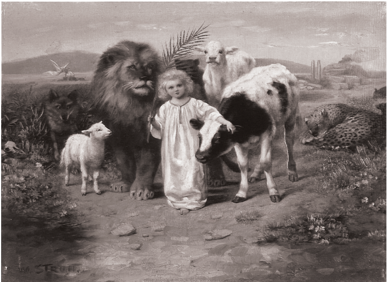
Figure 3. Painting by William Strutt, Peace , on the Isaiah passage.

In Adversus Haereses the Church Father teaches that the new heaven and earth of eschatology will be a re-creation of the old. The world will be re-established in its original state ( conditione revocata ) and this will be true of the animals as well. They will revert to their original food, the fruit of the earth ( fructum terrae ), which God gave them at first ( ad primam a Deo datam ). Irenaeus also indicates that the new creation will be at a far higher level than this present world, which is hard to imagine for mere mortals now. Whether the vegetarian food will be literal straw as we know it, is not really relevant for Irenaeus.